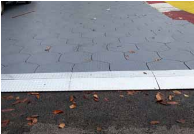
Steel Ramp for Heavy Vehicles