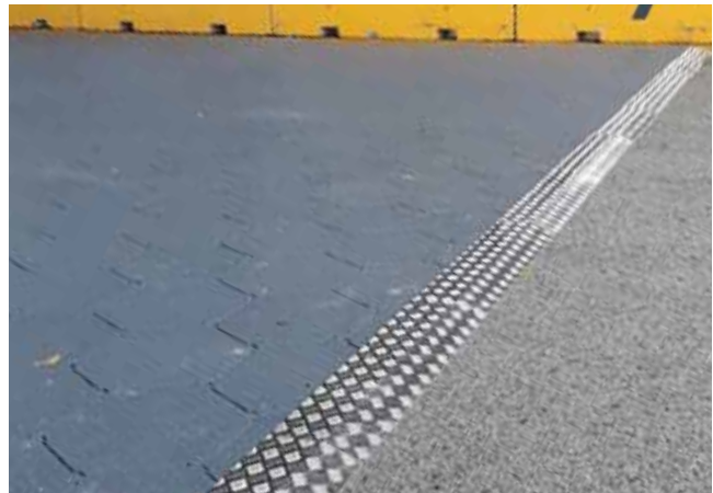
Aluminium Ramp for Pedestrians and Light Vehicles