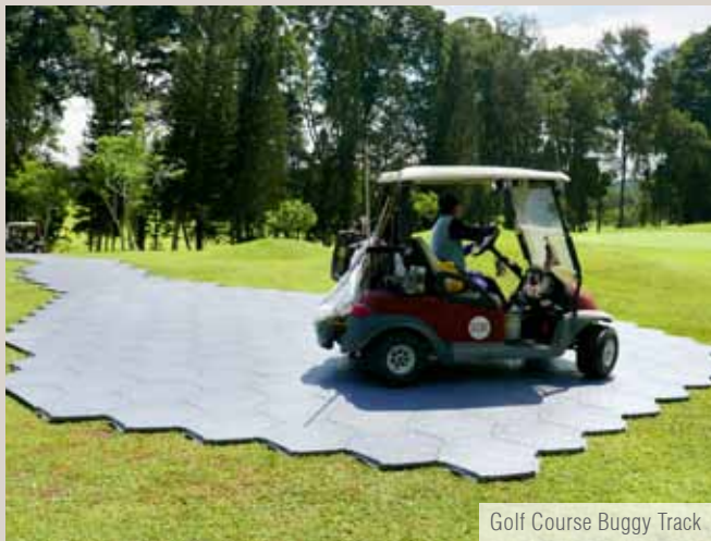
Golf Course Buggy Track