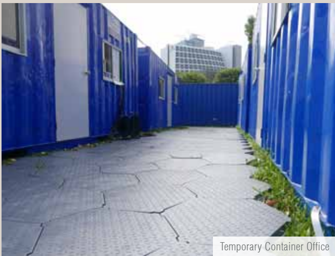
Temporary Container Office