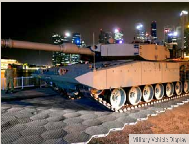
Military Vehicle Display